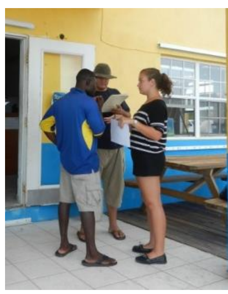
Turks & Caicos Islands