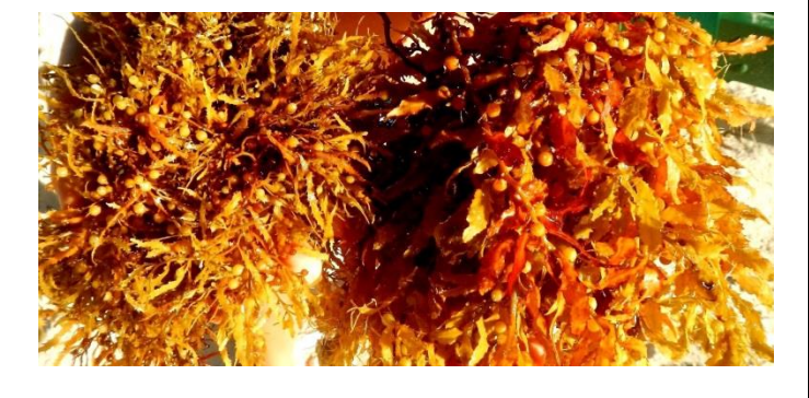
Left: Sargassum natans; Right: Sargassum fluitans

What is it? Pelagic sargassum is a brown alga, or seaweed that floats free in the ocean and never attaches to the ocean floor. These free-floating forms are only found in the Atlantic Ocean. Sargassum provides refuge for migratory species and essential habitat for some 120 species of fish and more than 120 species of invertebrates. It's an important nursery habitat that provides shelter and food for endangered species such as sea turtles and for commercially important species of fish such as tunas. There are two species of sargassum involved in the sargassum influx: Sargassum natans and Sargassum fluitans.