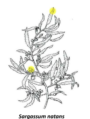
- Pods usually tipped with a spike - Leaves long-stalked and narrow