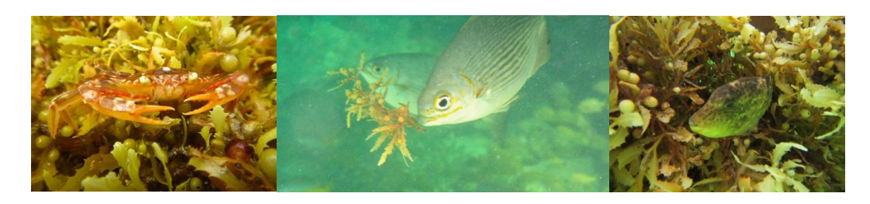
Sargassum life

What are some good practices to apply if removing sargassum from beaches? A review of experiences from beaches affected by sargassum in the Gulf of Mexico at the 2015 Sargassum Symposium hosted by Texas A&M University Galveston Campus, NASA Stennis Space Center and Galveston Island Park Board of Trustees highlighted that: