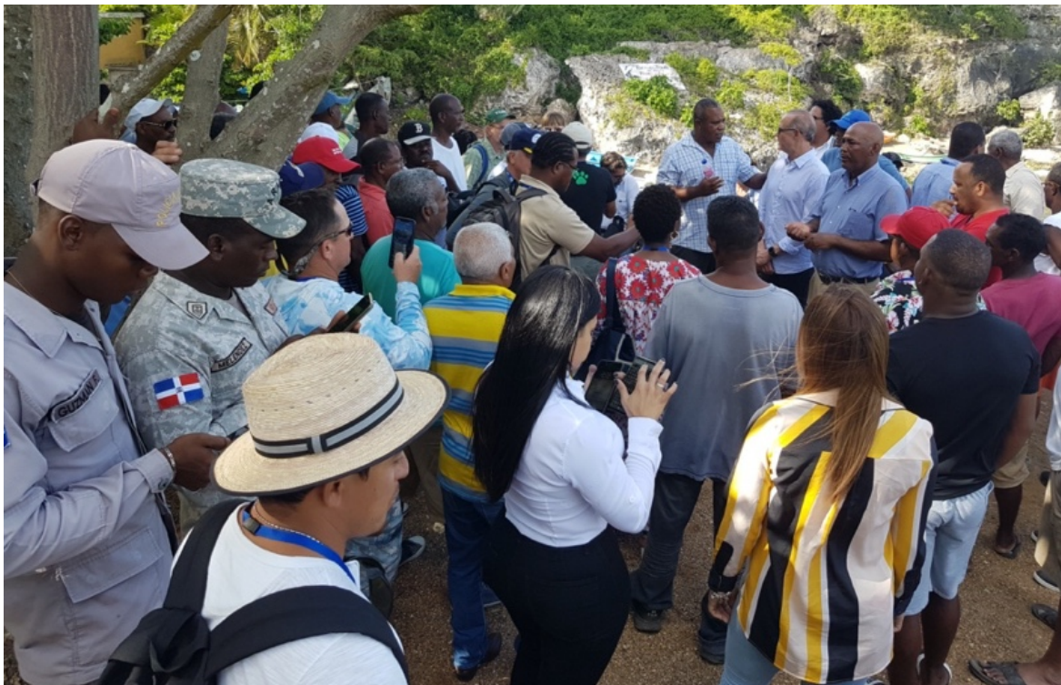
The fisher field trip creates opportunity for informal interaction between fishers and managers from many nations around the Gulf and Caribbean.