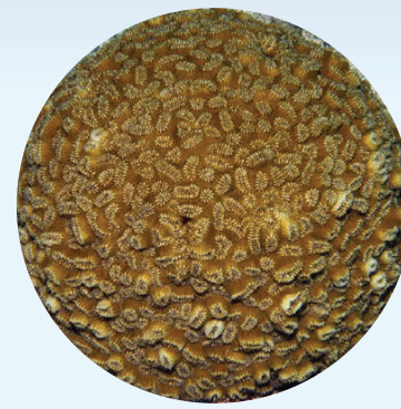
Healthy Stony Coral