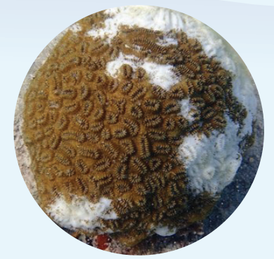
Sick Stony Coral