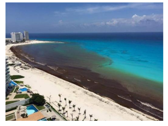
Mass influx of sargassum decomposing near shore and producing a dark brown plume.

poisonous hydrogen sulphide gas, which smells awful and is harmful to most marine animals. Prolonged exposure to high concentrations of hydrogen sulphide gas can also cause human health problems (including nausea, headaches, skin rash and even breathing difficulties) and can tarnish metals (coins, bathroom fittings, door knobs, even jewellery etc.) as well as damage sensitive electronic appliances (TVs, computers, air-conditioning units). As a result, insurance companies in the French Antilles are now covering losses