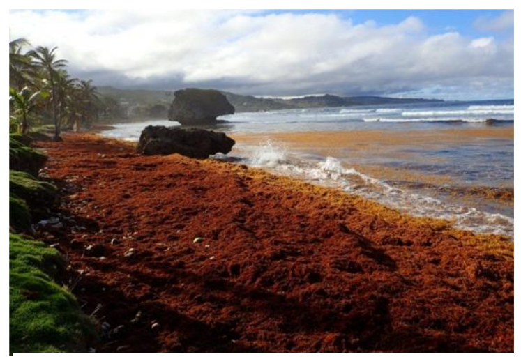
Mass stranding of sargassum on beach at Bathsheba, Barbados.

information on the recent 'sargassum influxes' (arrival of unprecedented mass quantities of sargassum seaweed) Caribbean the region; and. in importantly, by offering guidance on how best to sustainably manage the seaweed, based on lessons learnt to date. This first brief focuses on the immediate problem of clean-up, after mass strandings of the weed. Others will be developed that focus on potential commercial uses of the weed