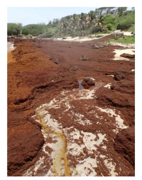
Decomposing sargassum along the shore.

Stranded sargassum can lead to beach fouling and reduce their attraction significantly, even more so when associated with entrapped anthropogenic litter such as plastics and hazardous medical wastes. As sargassum builds up along the shoreline, often becoming several metres thick, it can limit swimming and access to nearshore boat moorings and harbours, and prevent watersports activities.