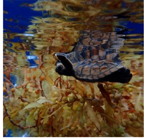
Sea turtle hatchling among sargassum

Where possible, it is generally agreed that in-water collection very close to shore is often preferable to beach collection, where permitted. This approach avoids removal of sand and damage to coastal vegetation. Concern for the conservation of species associated with the sargassum is warranted if the sargassum were to be collected in open water. However, by the time the sargassum rafts are very close to stranding, the majority of associated organisms will have already abandoned the raft, or will wash ashore