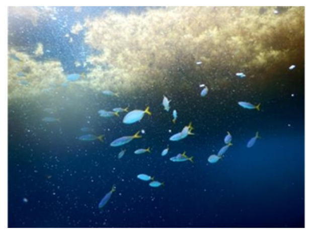
Floating sargassum with associated pelagic fishes.

Sargassum is a brown marine alga (seaweed) which is generally associated with the Sargasso Sea of the North Atlantic Ocean. It is made up of leafy appendages, branches and round, berry-like structures. These "berries" are actually gas-filled structures (mostly oxygen) which aid in buoyancy, allowing the sargassum to float on the