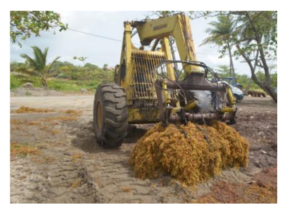
Using a cane-loader to collect large quantities of sargassum in Guadeloupe.

top and bottom layers of seaweed. In some countries a front-end loader with large load-bearing tyres has been used to remove the huge quantities. This has been effective when used to remove only the top layer without touching the sand and then a mechanised rake or manual removal is used to collect the rest. In the French Antilles they have experimented successfully with using cane loaders to pick up large quantities of sargassum, prior to clearing with a mechanised beach rake.