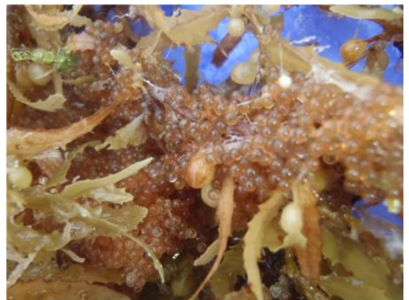
Flyingfish eggs on sargassum.

habitats for a diversity of marine species. These sargassum rafts provide refuge and food for over 250 species of fish and marine invertebrates, some of which are not found anywhere else (e.g. the iconic sargassum anglerfish). The rafts serve as important feeding grounds for migratory and commercially important species such as dolphinfish and tuna; act as spawning areas for flyingfish and eels; and as nursery grounds for endangered sea turtles. In addition, various species of seabirds (e.g. terns and boobies) forage