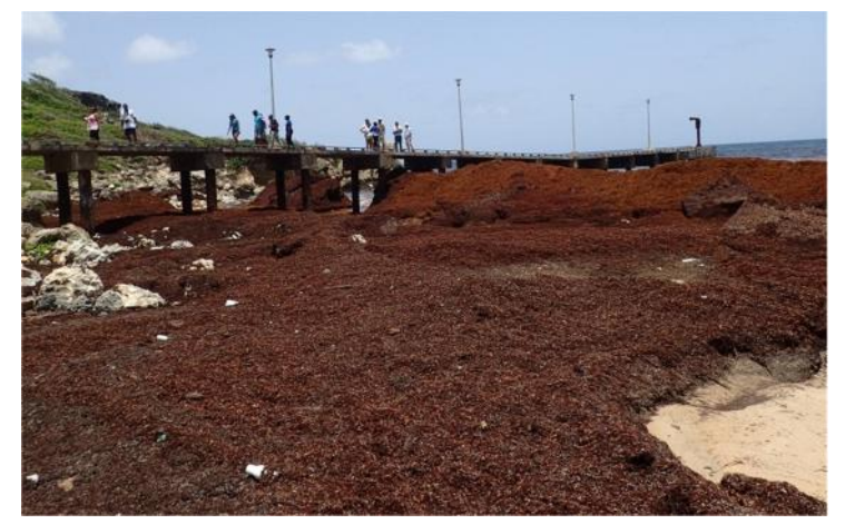
Inundation of Skeetes Bay, Barbados with sargassum.

Observations from the Sargasso Sea indicate that free-floating sargassum circulates seasonally between the Gulf of Mexico and North Atlantic, and exhibits considerable inter-annual variation in biomass of the seaweed and in frequency and volume of shoreline strandings. This year to