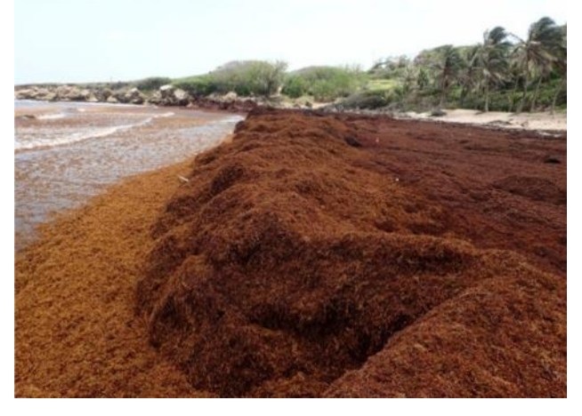
Barrier of sargassum along the shore of Skeetes Bay, Barbados.

inundations when sargassum piles up along the shorelines forming barriers several metres high, a combination of removal methods is likely to be required. In cases like this, the sargassum should be removed as soon as possible after arrival to avoid vast accumulations of the seaweed along the tideline which decomposes and serves to trap more weed in the water and form dark brown plumes nearshore. In such cases a multi-level approach will be needed, where different equipment is used to remove the