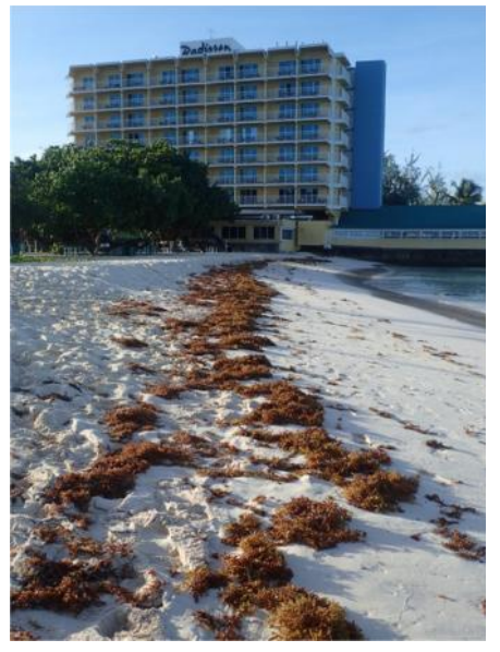
Small amounts of sargassum along the tideline are better left alone.

The most sustainable practice is almost always to let nature be. If sargassum washes ashore in small quantities or inaccessible, non-tourist or non-critical locations, it is generally preferable to leave the seaweed where it is. This has proven to be the simplest and least costly approach, and has the added benefits of potentially nourishing beaches and stabilising the shoreline. During decomposition of large amounts of weed there will inevitably be a smell and insects around; but, experience in locations that have left the sargassum on the beach is that it will eventually get washed away, buried by the next high waves, or sun dried, eliminating the smell.