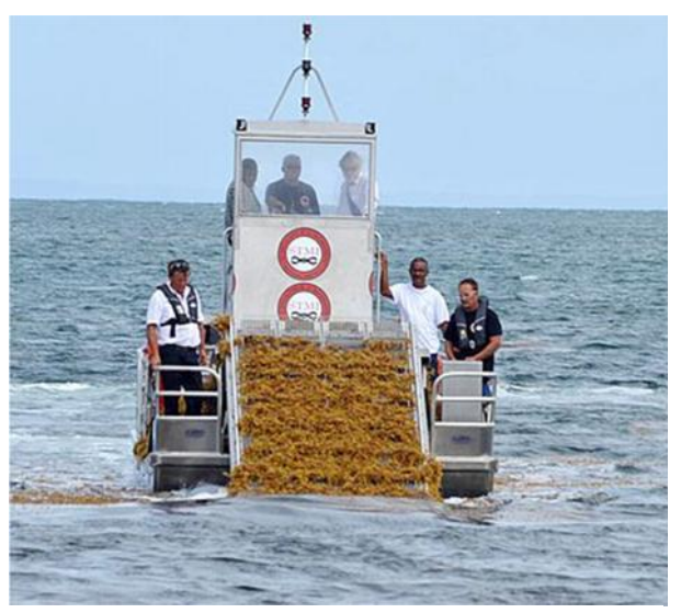
Specialised barge for picking up sargassum.

and be lost anyway. With that said, special care should always be taken with the removal of sargassum close inshore along sea turtle nesting beaches, as hatchlings leaving the beach will hide and remain in the weed.