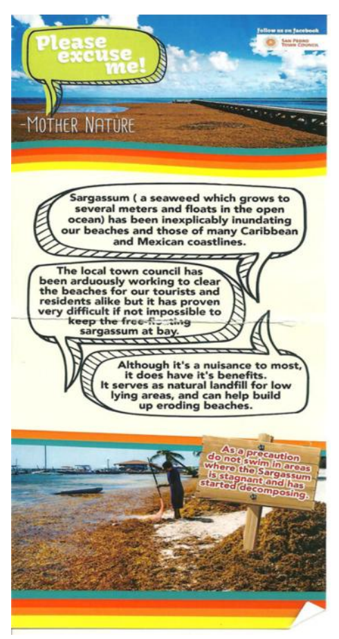
Sargassum flyer produced in Belize.

An important first step is to ensure coastal users and other stakeholders, including the general public, receive relevant and reliable information about sargassum and the periodic influxes in the region, as well as the on-going management efforts. Various communication methods can be employed such as public announcements, signs on beaches, distribution of fact sheets, brochures, infographics, a telephone hotline, documentary films and traditional (e.g. radio) as well as popular social media platforms. A good place to share information and learn from experiences across the region is the online forum set up for this purpose