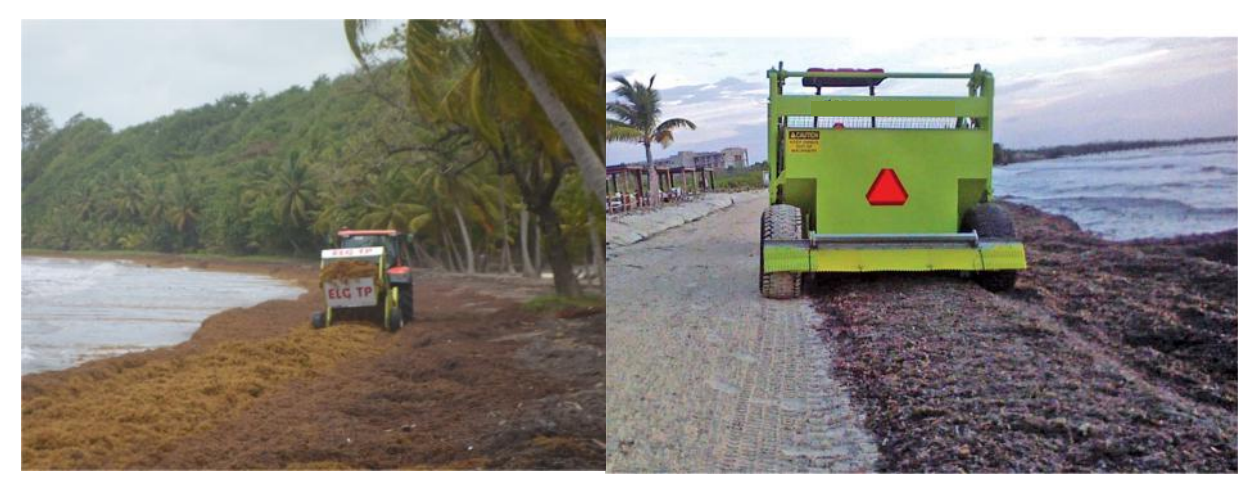
Mechanised beach rakes in action in Guadeloupe (left) and picking up sargassum, in Mexico (right).

Where manual pick up is not practical, mechanical equipment will have to be used and adequate storage and/or disposal of the collected seaweed must be organised. Mechanical beach rakes with a perforated conveyor belt and soft tyres have been found to be effective and work best with moderate quantities of weed and on beaches with low relief and easy access. Note however that