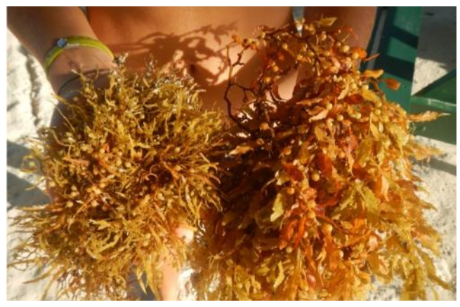
Sargassum natans & S. fluitans. ocean surface.

The sargassum species typically associated with the Sargasso Sea are the same species that have made up the recent mass intrusions in the Wider Caribbean and West Africa. These are Sargassum natans (common gulfweed) and Sargassum fluitans (broad-toothed gulfweed); both of which are native to the North Atlantic