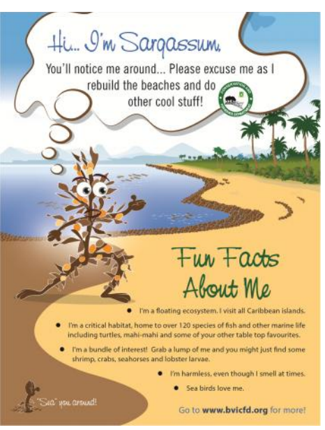
Example of poster in the British Virgin Islands.

by the UNEP-CEP Regional Activity Centre for SPAW